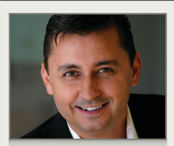
Topics Creating a Culture of Execution